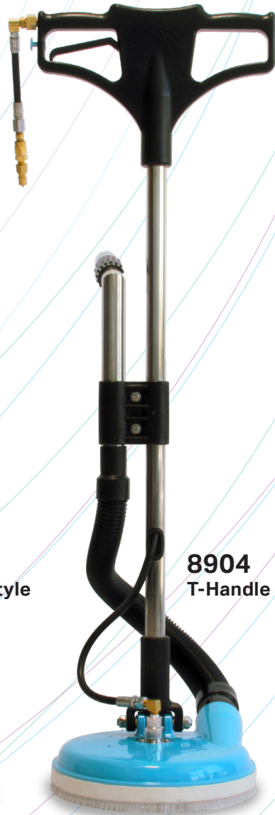
8904 T-Handle Style