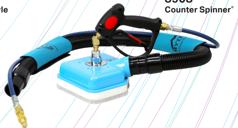
8908 Counter Spinner®