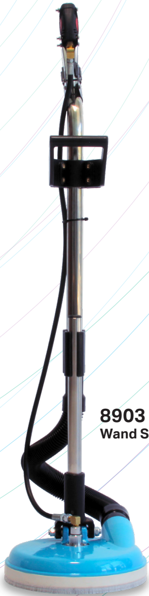
8903 Wand Style