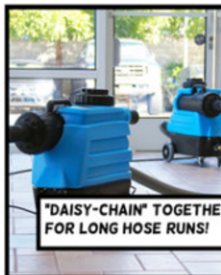
"DAISY-CHAIN" TOGETHER FOR LONG HOSE RUNS!