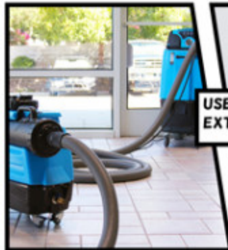
USE AS A STAND-ALONE EXTRACTOR!