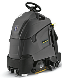
CHARIOT™ 2 ISCRUB 22 SP