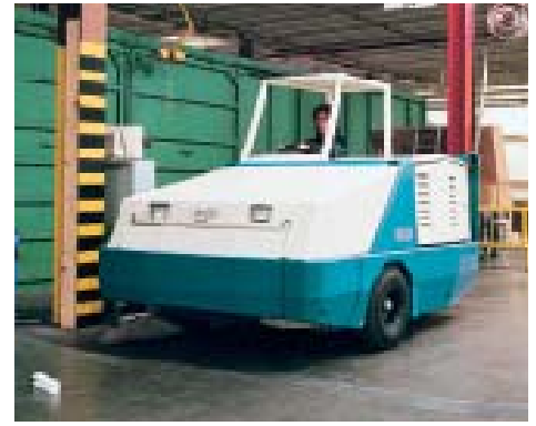
This rugged machine practically pampers its operators with an energy absorbing seat, tilt steering wheel, power steering, and an adjustable drive pedal.