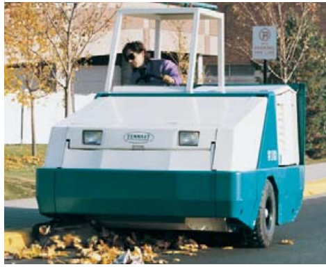
The 810 makes light work of picking up rocks, leaves and other debris — and keeps kick-up dust to a minimum.