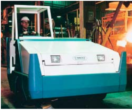
The 800 cleans a wide 66" path, and performs even under the toughest conditions.