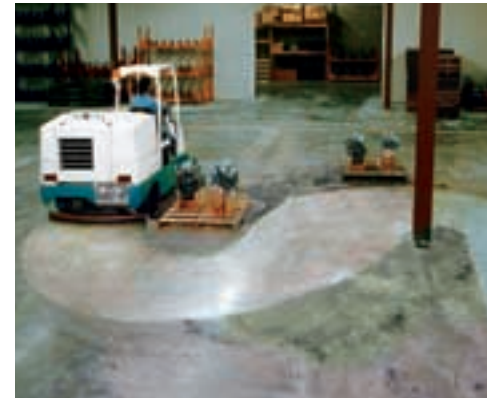
Front wheel propulsion makes for dynamic maneuverability around obstacles.