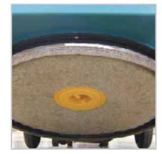
Tilt back shut-off for operator safety and quick pad adjustment and removal.