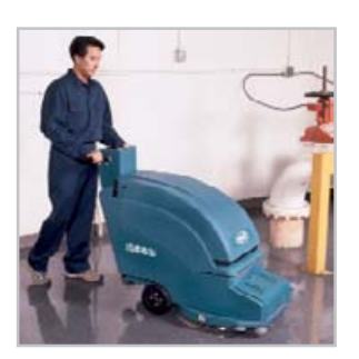
Ideal for retail, education and healthcare, the 2510 and 2550 models are excellent for burnishing hard floor surfaces to a brilliant shine.

Choose Tennant Burnishers for the Best Shine