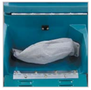
Easy access to dust filtra tion compartment for quick disposal of debris.