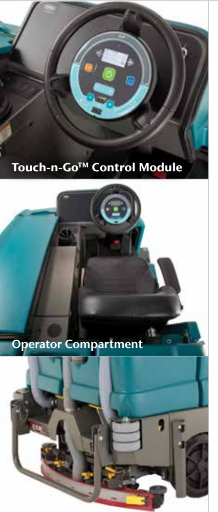
Dura-Track<sup>™</sup> Parabolic Squeegee