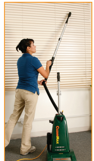
Quick Draw Tools Extends your cleaning reach