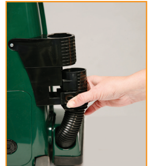
Quick Clean-Out Port Provides easy access to clear away debris