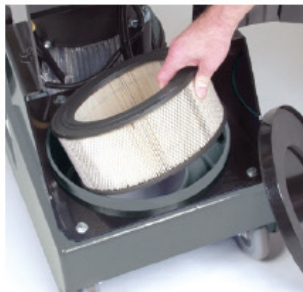
Automotive style air filter for improved indoor air quality. Dust Control system extends pad life by preventing particle build-up in the pad.