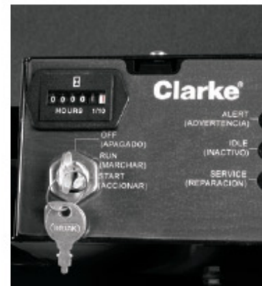
Control panel lights inform operator of emissions and engine performance. Planned maintenance intervals are easily monitored with the onboard hour meter. Standard key-ignition switch prevents unauthorized use.