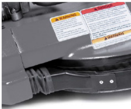
The Dust Control series offers a unique floating shroud that directs the high velocity airflow near the floor to collect six times as much dust as competitive models.