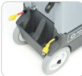
Independent, disconnect cords for heater and vacuum pump.