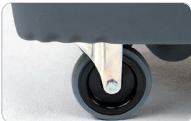
Finger grips provide assistance when lifting the machine.