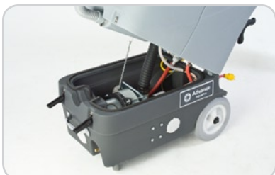
Clam shell design allows easy access for servicing.