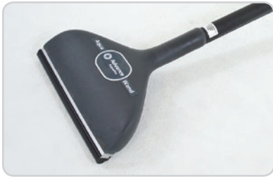
The low friction glide and light weight AquaWand is designed for less operator fatigue.