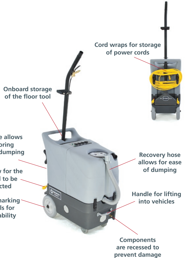
Onboard storage of the floor tool