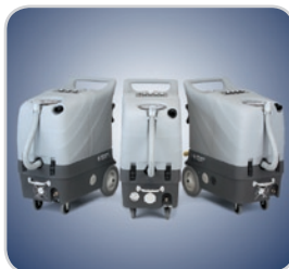
The Advance AquaPro® line of portable extractors is available in three models, the XP, H and C. There is a version for a variety of cleaning applications.