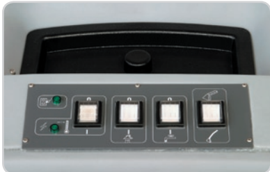
Waterproof control panel to protect against spills. The solution tank fill port is recessed to contain spills.