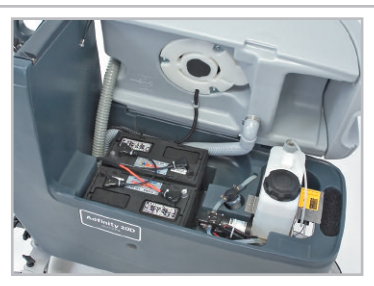
Access to batteries and AXP onboard dispensing system