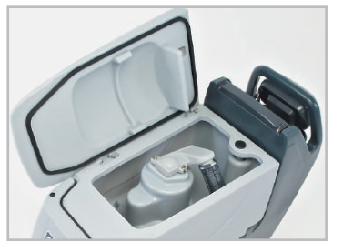
Large recovery tank with easy access to inspect and clean tank. Easy access to ball float shut off.