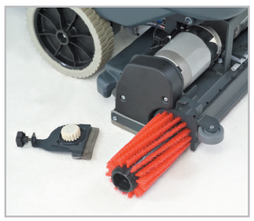
Tools-free removable brushes on all model scrub decks