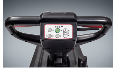
Intuitive control panel provides control over all functions (AS4325 model)