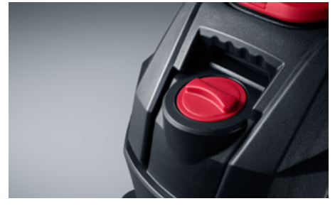
Convenient front access to solution tank for quick refills