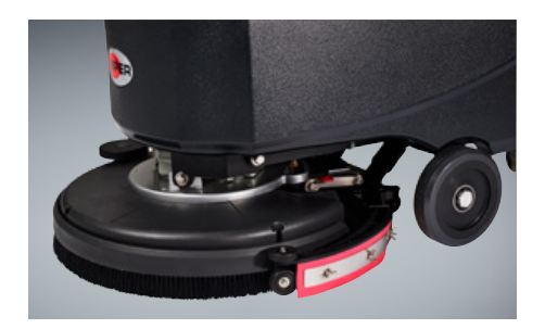
Tool-free removal and assembly of squeegee simplifies maintenance