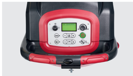
Intuitive control panel with LCD screen comes standard on all models (AS6690T/AS7690T shown)