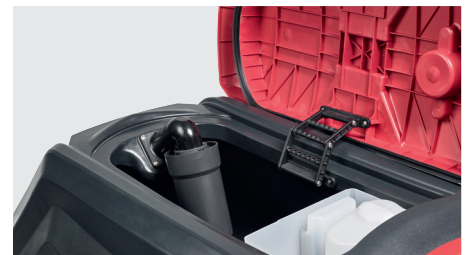
Large opening recovery tank and standard debris tray for quick and thorough clean up