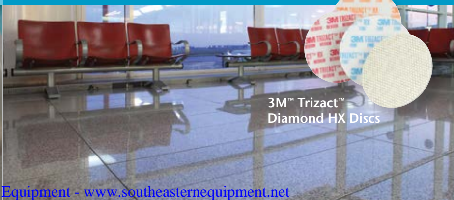
3M™ Trizact™ Diamond HX Discs