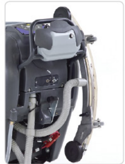
A built-in squeegee hanger makes transport easier and reduces trip and fall accidents.