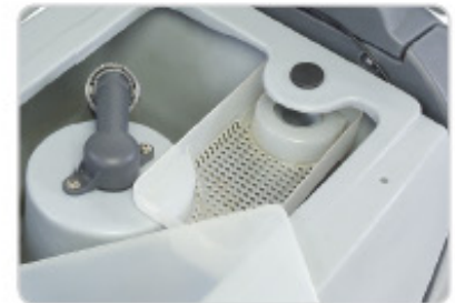
An integrated debris catch cage traps and collects drain clogging debris.