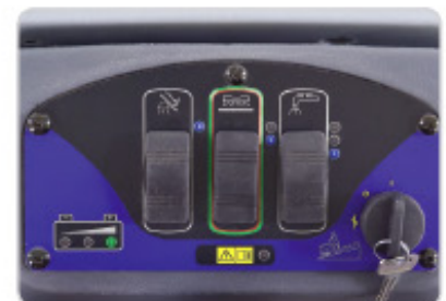
The ST 26 inch disc model – provides simple operation and robust scrubbing controls.