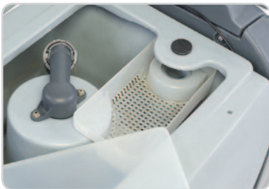
An integrated debris catch cage traps and collects drain clogging debris.