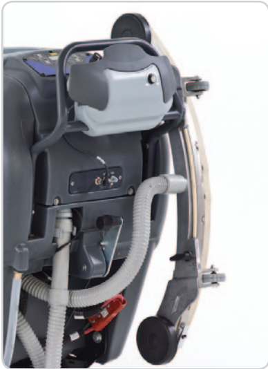
A built-in squeegee hanger makes transport easier and reduces trip and fall accidents.