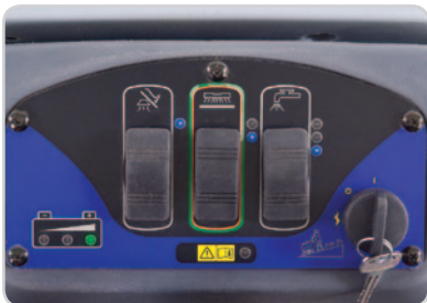
The ST 26 inch disc model – provides simple operation and robust scrubbing controls.