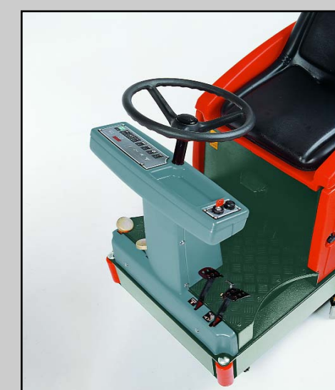
Operator compartment: The operator can access the driver's seat from both sides with an excellent view of the area to be cleaned. All operating elements are in direct view and easy reach of the operator. Adjustable, comfortable driver's seat.