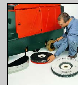
Brushes: Brushes and pads can be changed in a flash without the use of tools.