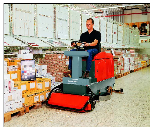
With pre-sweep and tool: Pre-sweeping and scrubbing in one operation, additional scrubbing and vacuuming tool for edges and corners.