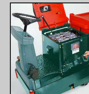
Batteries: Battery system easy to access with quick exchange device (optional equipment).