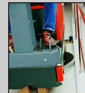
Working close to the edge: Poses no problem with protruding brushes and suspended squeegee.