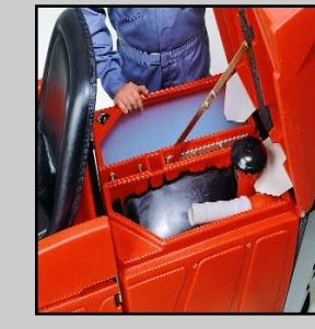
Tank: Large flexible wall tank, 37 gallons. Outlet hoses with dosage device for quick emptying.