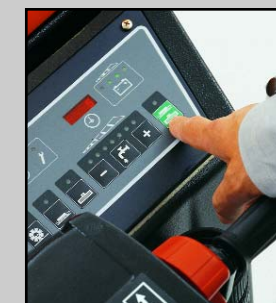
Operating panel: All cleaning functions can be started simultaneously. Quick and easy.