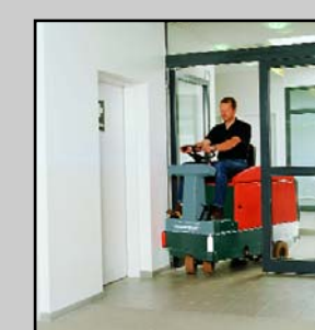
Compact and maneuverable: Fits through any standard door. Minimum passing width of 27in.