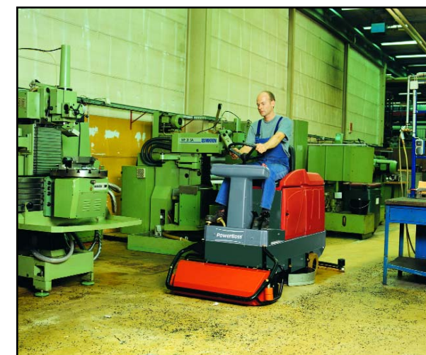
Admiral 35: For perfect maintenance or basic cleaning. Highly maneuverable, compact, easy, light handling, powerful and efficient.