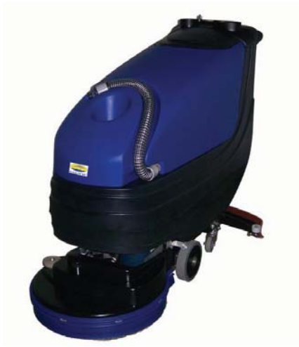
Z20T and Z20BA

Small in stature, big on scrubbing performance