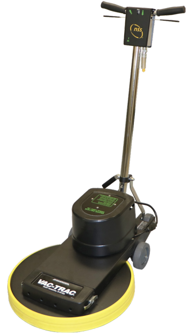
Mustang 1500 with Vac-Trac