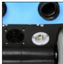
Runs on a single power cord