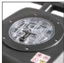
Clear recovery tank lid