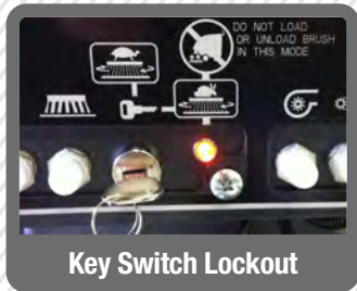
Key Switch Lockout