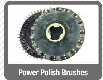
Power Polish Brushes