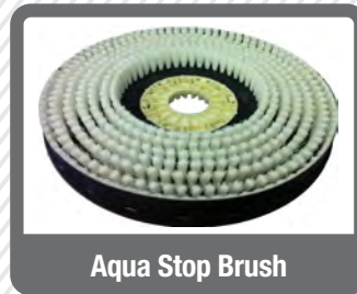
Aqua Stop Brush