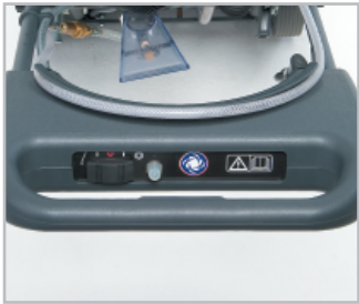
Simple controls make it easy to learn and use.