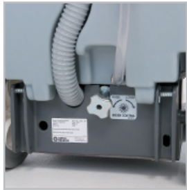
Fully variable brush height adjustment control.