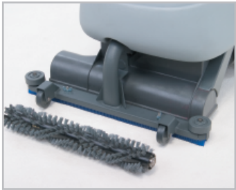
Optional hard floor converts any AquaClean® into a hard floor scrubber.