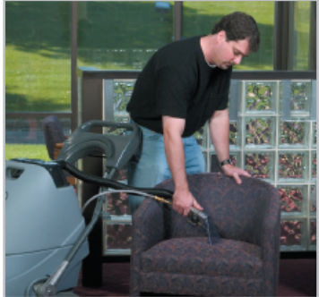
Carpet extraction and spotting/upholstery machine in one with integrated hand tool.