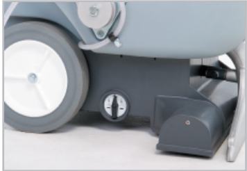
Smart Solutions™ DCM on 16XP and 18FLX for deep cleaning or high productivity.