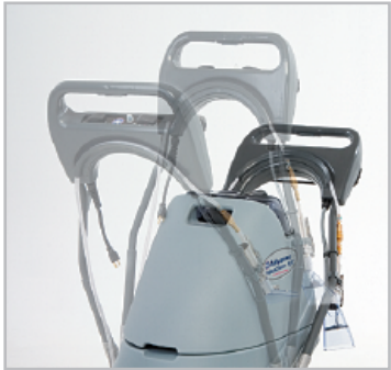
18FLX has dual operating modes for traditional or high productivity walk behind extraction.