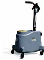
PS 4/7 BP OBC MISTER