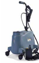
PS 4/7 ELECTROSTATIC SPRAYER