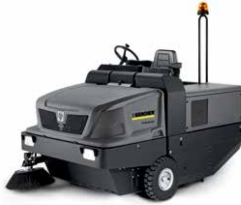
KM 150/500 R Bp / KM 150/500 R Bp 2SB