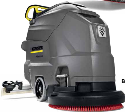
BD 50/50 C CLASSIC BP