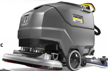
BD 70/75 W BP CLASSIC