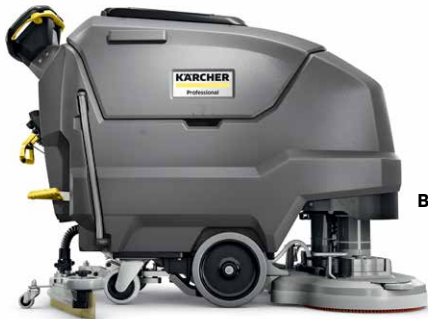
BD 80/100 W BP CLASSIC

Designed to meet all of your scrubbing needs without breaking the bank. With the BD 70/75 W Classic Bp, BD 80/100 W Classic Bp and BD 50/50 C Classic Bp scrubbers, Kärcher presents its Classic Scrubber Line. Battery-operated machines with a very solid construction and are characterized by simple operations. They offer an economical start in floor cleaning and are suitable for use in industrial facilities, retail stores, municipalities, education and for cleaning buildings. No matter the area size you're cleaning, there's a classic solution to fit.