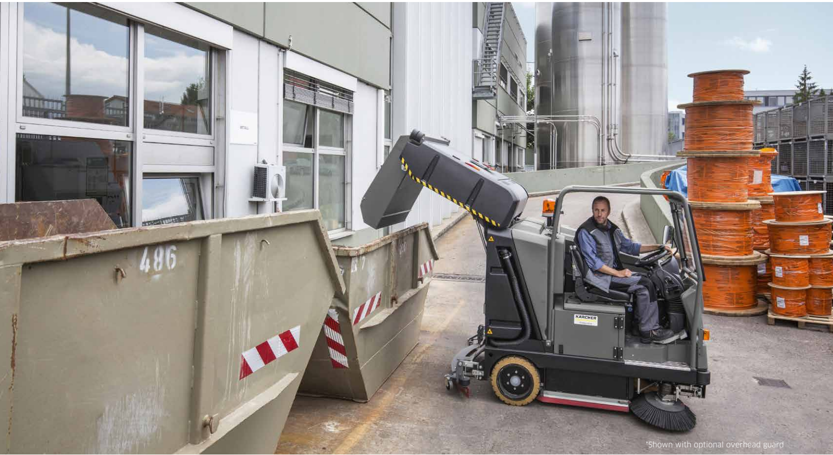
*Shown with optional overhead guard