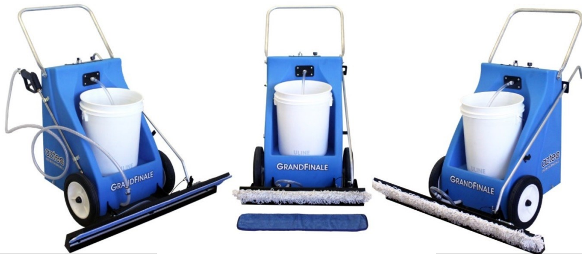
Spray Wand Upgrade: ID# 050-1S, 050-H-36

No puddles, dry spots or streaking thanks to the Grand Finale's battery powered precision release system. Step 5 in the WorkSmart™ VCT Strip System, or as part of the WorkSmart™ Maintenance System or the WorkSmart™ Concrete System. Optional spray wand upgrade.