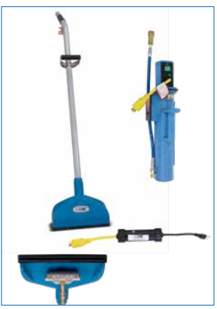
Part #: 705HR-TK