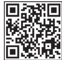
Watch the BOOST Video

Specifications are subject to change without notice.