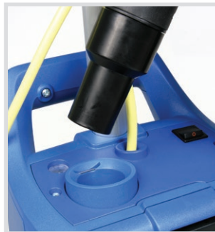
Hose removes for quick clog checks.