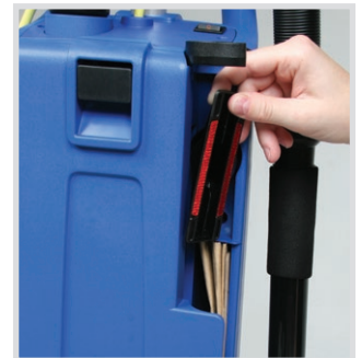
Tool and storage compartment is located directly behind the quick-draw wand.