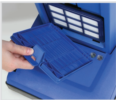
Convenient access to standard H.E.P.A. filter.