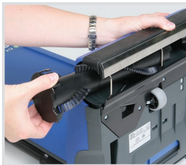
Easy to change brush. Simply unlock the brush and pull out.