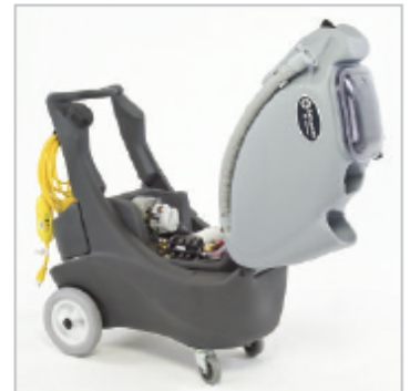
Clam shell design for easy access to the component pallet