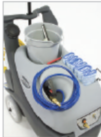
Micro Cleaner™ has storage for standard accessories