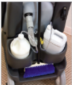
Universal chemical bottle storage