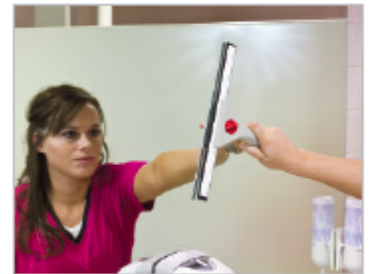
All surfaces are easily cleaned after initial spray down