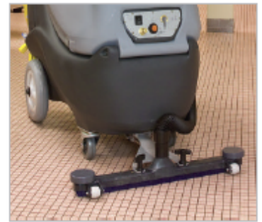
Optional front mount squeegee for easy water pick-up