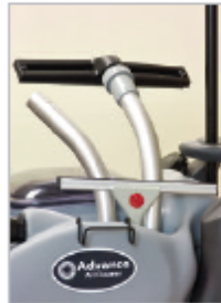
Standard accessories are easily stored on machine