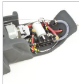
Component pallet is removable