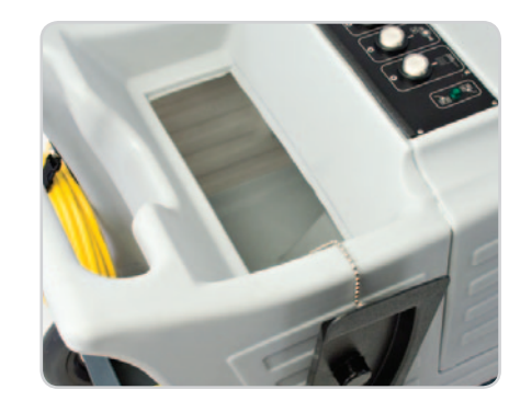
The solution tank fill port is recessed to contain spills.