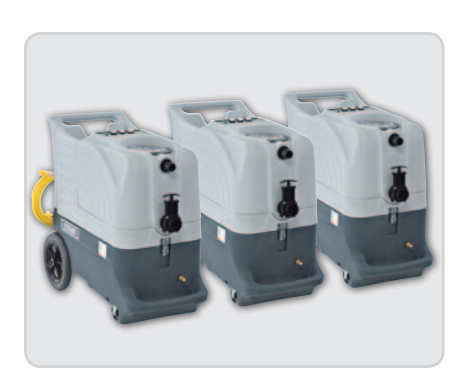
The Advance ET600 line of portable extractors is available in three models; non-heated 100-psi, heated 100-psi and heated, variable 0-400-psi to meet diverse cleaning applications.