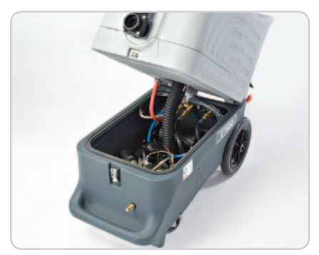
Clam shell design allows easy access to machine components, expediting servicing and maintenance.