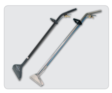
Operators have the choice to select between the light weight AguaWand™ and single or double bend stainless steel wands.