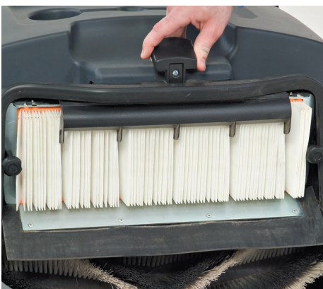
Filter shaker easily combs filter for cleaning. A well maintained filter will last for over 100 hours of operation.

Schools and Universities Hospitals / Healthcare Casinos Commercial Cleaning Facilities Health Clubs Office Buildings Airports / Train Stations / Bus Depots Hotels Government Buildings and Installations