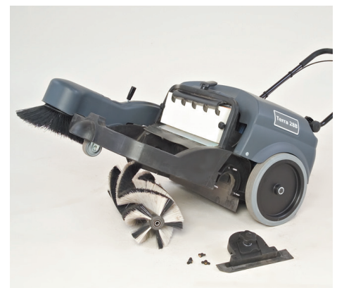
Tools-free removal of brooms and hopper makes for easy maintenance.