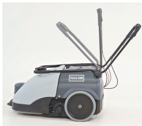
Adjustable handle folds for easy storage.