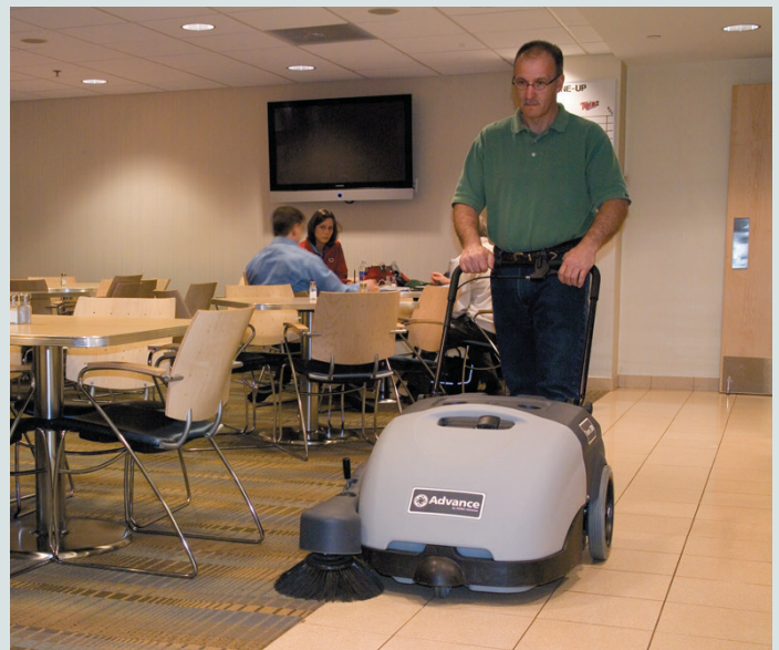
Terra® 28B easily cleans both hard and soft floors without having to change brooms.