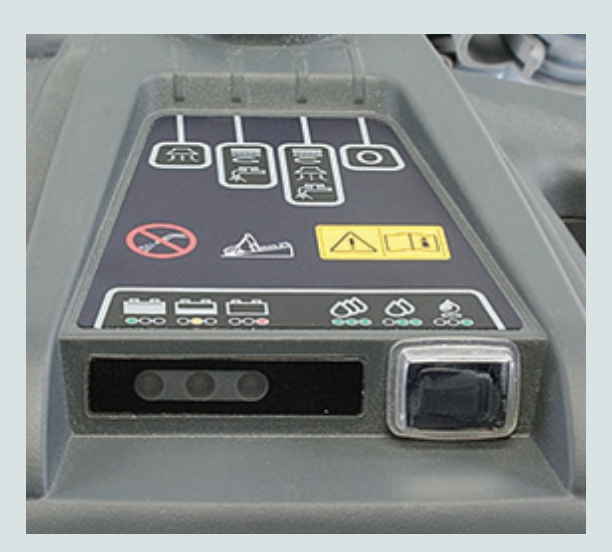
Electronic solution control for low, medium and high flow.

Operating at a sound level of only 67 dB A, the SC400 meets LEED-EB and GS-42 noise standards—allowing for daytime cleaning or cleaning of noise-sensitive areas. The Smart Solutions<sup>™</sup> setting calibrates the machine's solution flow, which enables users to meet green cleaning requirements by minimizing the use of water and detergent. The SC400 comes standard with maintenance-free gel batteries, eliminating safety concerns associated with traditional wet-acid batteries.