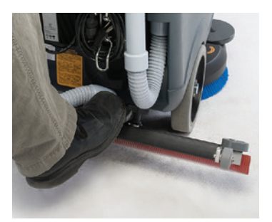
Foot-activated squeegee lift for easy operation.