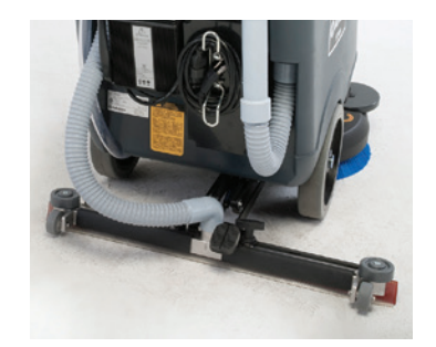
Center-pivot squeegee system employs a gas spring for maximum blade pressure to ensure complete dirty solution pickup in both forward and reverse.