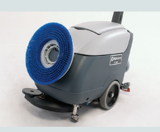
Brush stored on front for ease of transport.