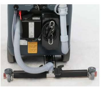
"Break-away" rear squeegee prevents damage to the machine and facilities.