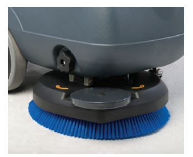
Offset and low profile scrub head for superior edge cleaning. Click-off/ click-on scrub heads for hands-free scrub head attachment and removal.