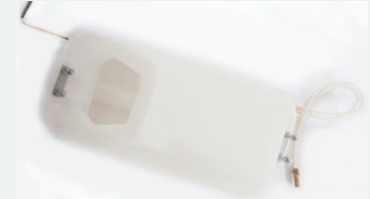
Solution tank kit for wet applications

Visit http://www.advance-us.com or contact your Advance sales representative to learn more.