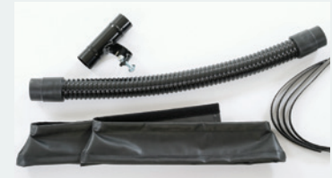
Dust containment kit for dry applications