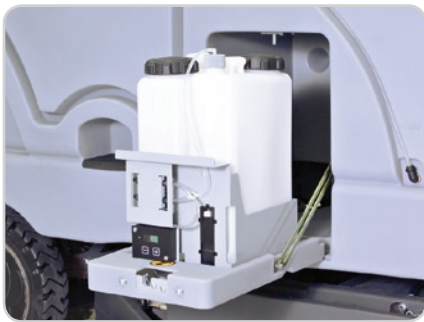
The AXP™ Onboard Detergent Dispensing System provides productivity and savings through accurate dispensing.