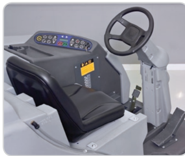
The Clear-View™ machine design provides excellent sight lines to the floor from the comfort and safety of the operator's seat.