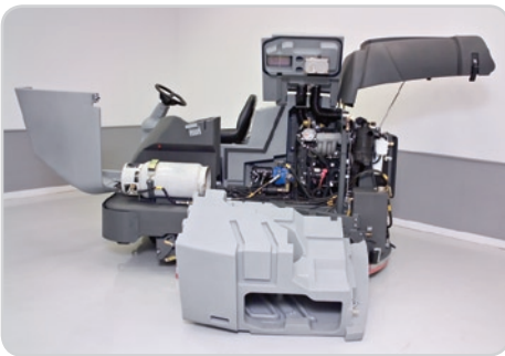
MaxAccess™ design provides 360 degree access to machine components.