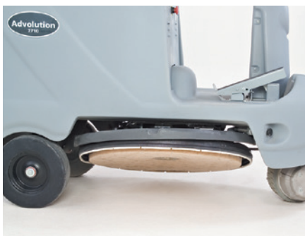
Mid-mounted, burnishing head tilts up for access to change burnishing pads quickly and easily.