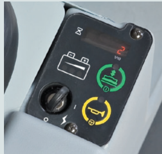
Simple, One-Touch™ operators button.

Operators of the Advolution 2710 rider burnisher can expect uncompromised safety. Open sight lines in front of the machine create a safe and comfortable ride for the operator. Automatic safeguards eliminate unmanned start-ups, which can lead to damaged floor finish. A safety switch prevents accidental pad start-up in the tilt-up position. Passive dust control is standard on the Advolution 2710 rider burnisher, which reduces the need for dust mopping. An active dust control kit is available as an option for environments that require a higher degree of filtration.