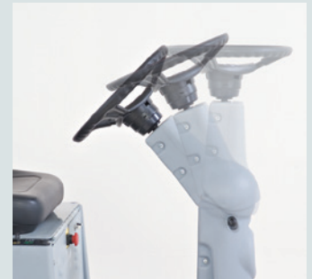
Steering is adjustable to five positions for operator comfort.