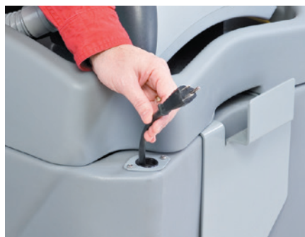
Plug for onboard charger option is easily accessible.