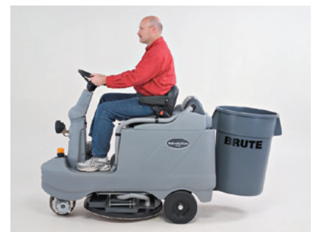
Equipped with optional accessory kits, the Advolution™ 2710 becomes multi-functional.