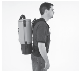
Adgility™ XP fits comfortably on the operator.