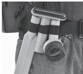
Accessory loops keep tools handy while operating.