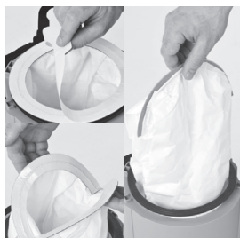
Full dust bag can be sealed before removal to contain all dirt.