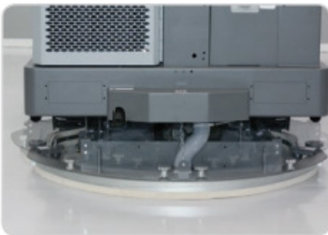
Patented Accu-Track™ squeegee provides superior water pick-up even during the tightest turns.

Sweeping System – separate sweeping system with variable or manual dump hopper picks up dirt and debris before scrubbing