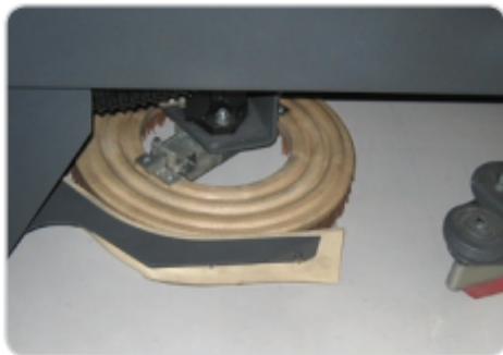
Scrub brushes with 600 pounds of downward pressure provide the most aggressive cleaning possible, yet brushes can be easily changed without tools.