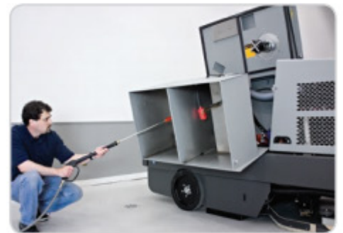
Recovery tank tilts out for quick and easy clean-up, reducing the amount of time needed for draining and refilling.

800.440.6723 • www.southeasternequipment.net