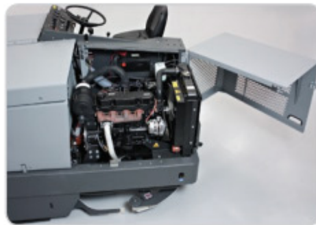
Maintenance is a breeze with easy-to-reach engine, electrical and hydraulic components.