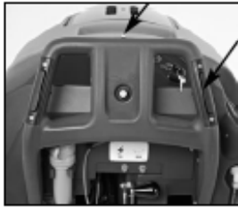
Easy to use palm switches on durable handle