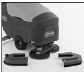
Heavy duty deck skirting system