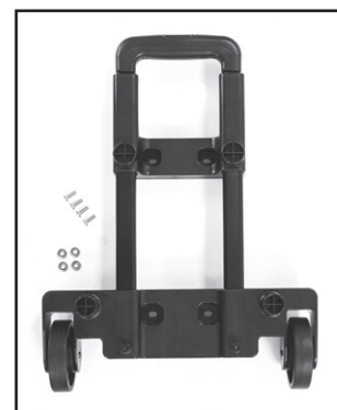
Optional Trolley Kit (part number VV78406)

Manuals, parts, and videos may be viewed online at www.usvipер.com