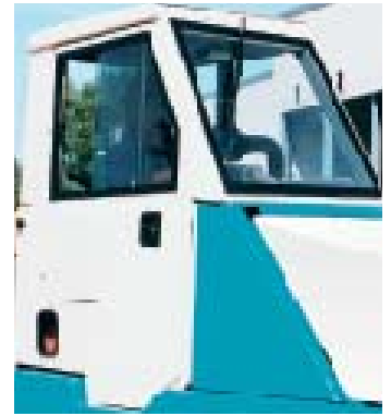
A deluxe cab is available with pressurizer, heater or air conditioner.

Both the Model 800 and 810 are available with Severe Environment (SE) options that offer special machine protection, heavy-duty tower bumpers, regenerative filter system, and a stainless steel hopper bottom that's ideal for aluminum reduction plants, foundries, steel mills or other extremely rugged environments.