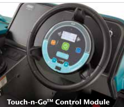
Touch-n-Go™ Control Module