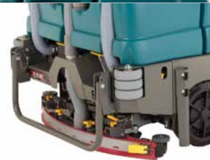
Dura-Track™ Parabolic Squeegee