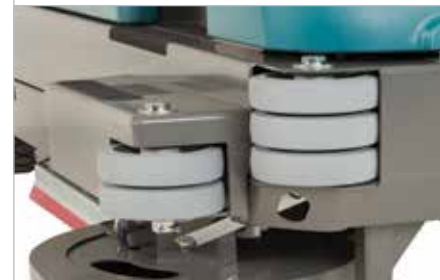
Heavy-duty Frame and Cushioned Corner Rollers

Overhead guard protects operators from falling objects.