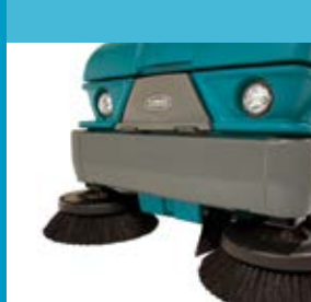
Minimize risk of damage and machine repair costs in harsh environments with optional tower bumpers that protect against accidental contact with hard objects.

Clean off aisle and in tight spaces with the convenient optional vacuum wand it is always there when you need it.