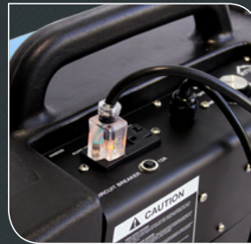
Daisy-chain multiple units together using the 12 amp outlet