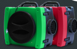
Also available in green and red