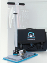
SOS PRO Sub Surface Extraction Tool by StainOut System