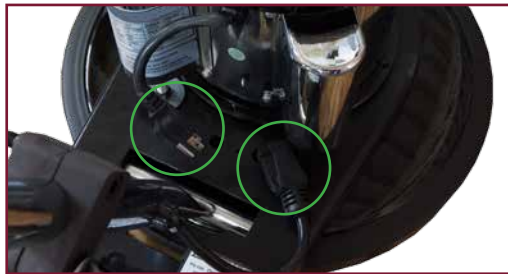
Convenient Unplug to disconnect motor for service

Mirage burnishers simplify bringing a smooth, super high-gloss luster to any hard floor surface.