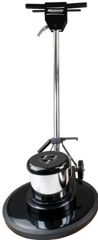
"Single speed unit shown here"