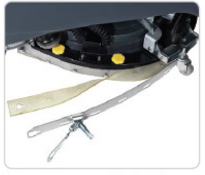
Squeegee wraps around the deck for 100% water pick-up and simply clips onto the bracket with no thumb nuts or adjustment required.