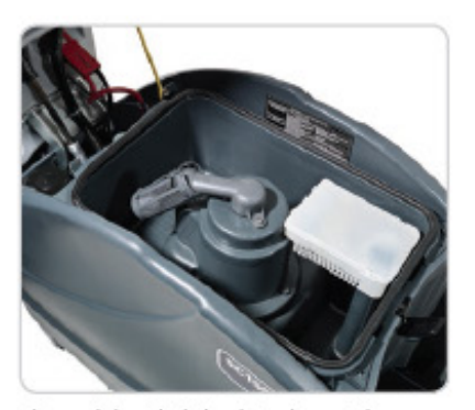
Flip-up lid and tilt-back tank provides easy access to the recovery tank, debris catch cage, batteries and EcoFlex<sup>110</sup> cartridge.

Rear polyurethane tires for outstanding traction and high durability