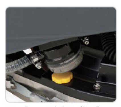
Externally mounted solution filter allows operators to easily clean the filter and manage the solution level.