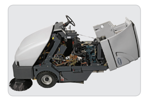
MaxAccess™ allows faster repairs and less downtime so the sweeper spends less time in the shop and more time sweeping