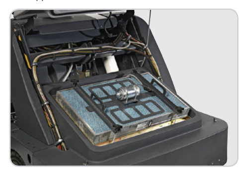
Patent pending Liberator™ Variable Frequency Filter Shaker System removes dust more effectively from the panel filter, resulting in better air flow and dust control