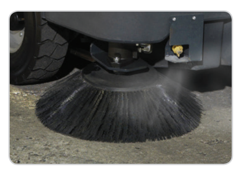
DustGuard™ suppresses airborne fugitive dust where most dust is generated – at the side brooms