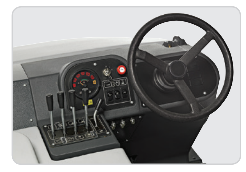
Ergonomic operator interface uses Analog-logic™ which allows a singe operator motion to lower and activate the main broom and side brooms and open the hopper door.